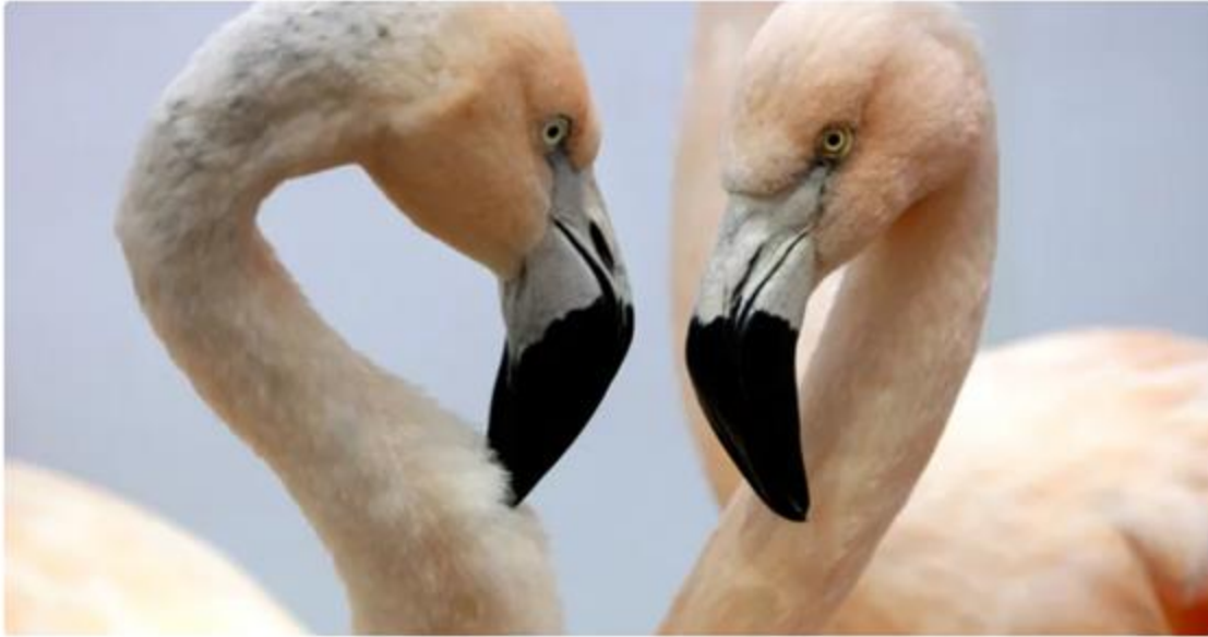
A pair of same-sex chilean flamingos have successfully hatched a newborn chick.

Two adorable same-sex flamingos have hatched an egg at a UK zoo, staff have revealed.