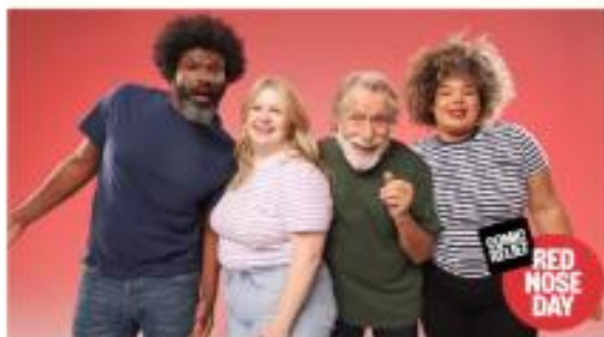
Newsome Academy's Page Comic Relief - Red Nose Day 2026