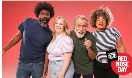
Newsome Academy's Page Comic Relief · Red Nose Day 2026